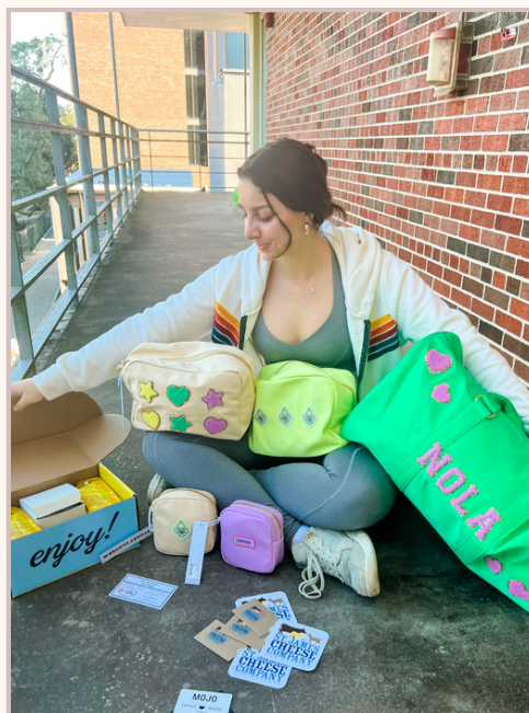
Giveaway Annoucement Point system & Purpose