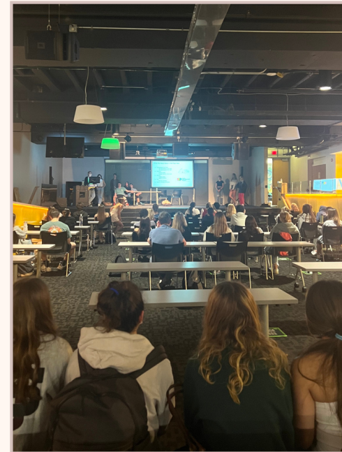
Feb 6. Member Meeting Semester Planning, Canes, & Fundraiser Info