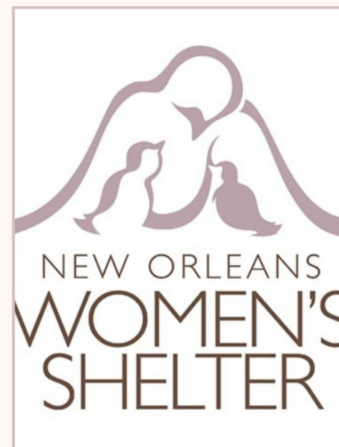
NOWCS Room Fundraiser What we have coming up...