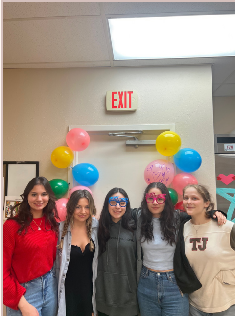
NOWCS Birthday Volunteer Opportunity